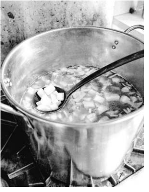
Ingredients for this beef stew were prepared separately the evening before by one of the volunteers and then put together in the pot Nov. 12 just before Noon Lunch.